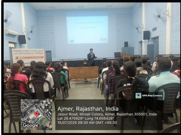
Ajmer, Rajasthan, India Jaipur Road, Mirsali Colony, Ajmer, Rajasthan 305001, India Lat 26.476929° Long 74.656428° 15/07/2025 09:30 AM GMT +05:30