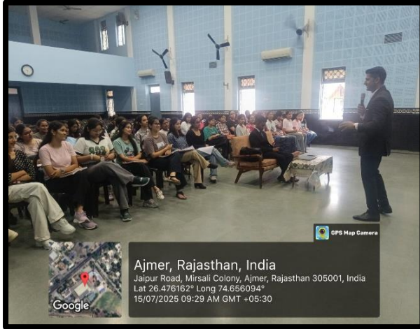
Ajmer, Rajasthan, India Jaipur Road, Mirsali Colony, Ajmer, Rajasthan 305001, India Lat 26.476162° Long 74.656094° 15/07/2025 09:29 AM GMT +05:30